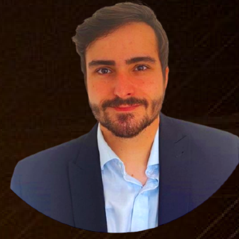
Will Talbot ARGUS MEDIA